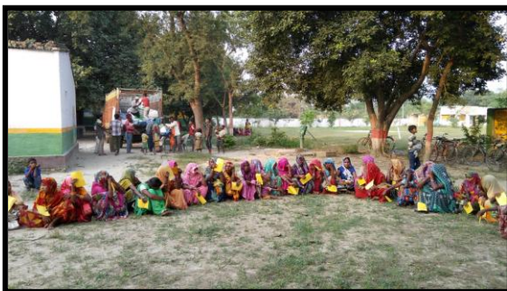
Our loaded the Kit