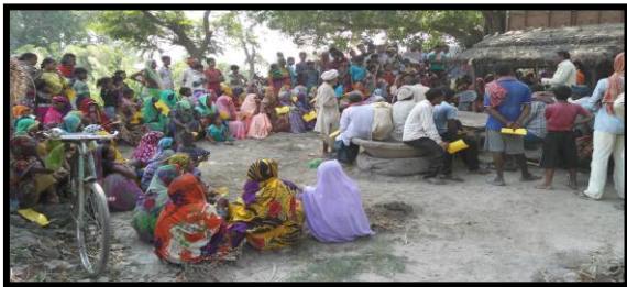
People are learning how to use Tablet