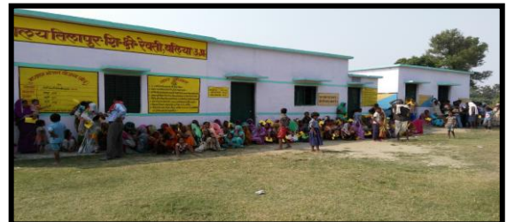
crowd of Flood affected people are waiting of their No.